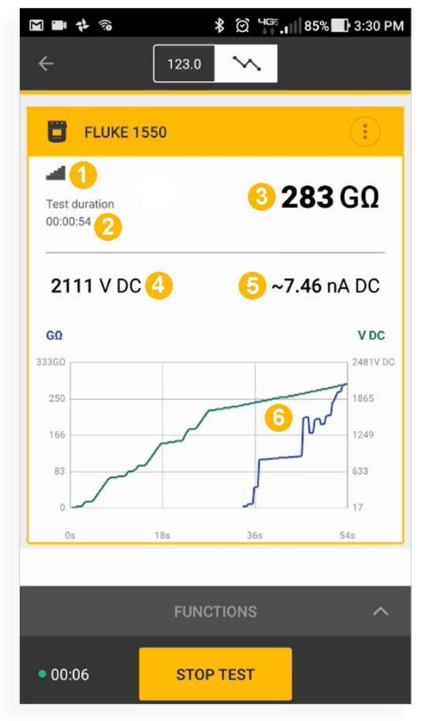
This single display on your smartphone or tablet gives you more information, in less time, than was previously available with just the instrument display.