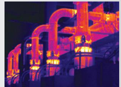
MultiSharp Focus, available on the Ti450.